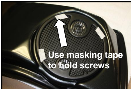
Insert black 6-32 screws through outer grille