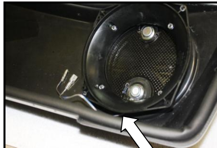
Route wire thru notch & under adapter