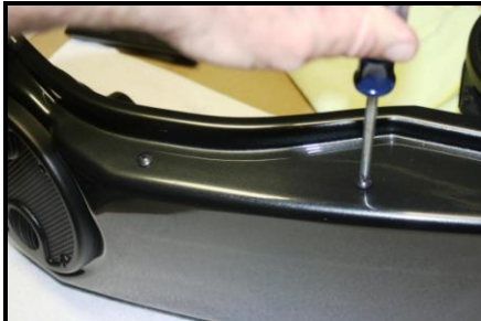
Remove 3M tape backing from bracket and tighten screws