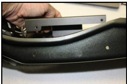
Position Tether Bracket as shown & loosely attach screws