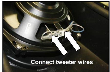
Connect tweeter wires